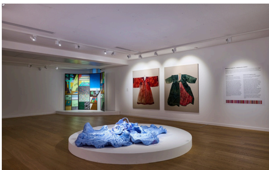
© KOREAN CULTURAL CENTER – COLORS OF KOREA