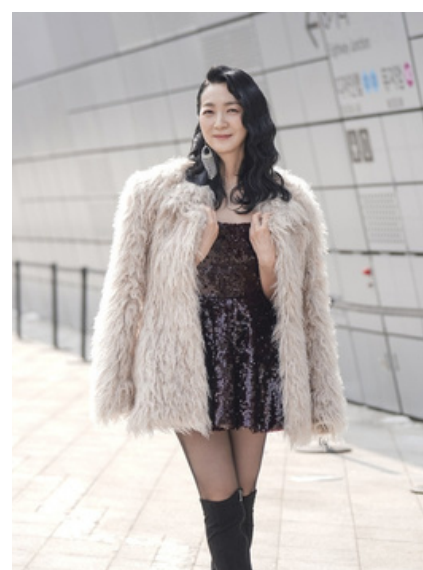
INTERNATIONAL STAR KIM JOO-RYOUNG (1.8M INSTAGRAM FOLLOWERS)