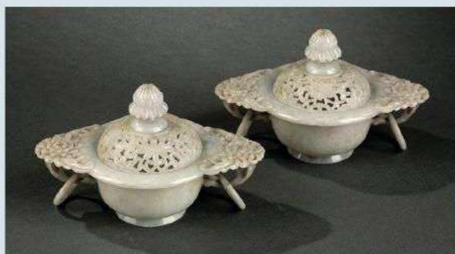
Above: the Paris Asian art dealership Galerie Valérie Levesque will be exhibiting at Printemps Asiatique from the gallery on the rue des Saints-Pères. Works on offer include this pair of covered jadeite bowls dated to the late Qing dynasty (early 20th century). They measure 6in (15.5cm) in width, are finely carved and pierced with foliate and floral motifs and are priced at €9000 . ▶ galerievalerielevesque.com