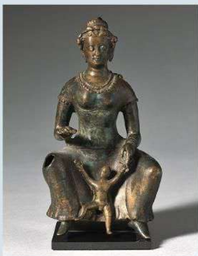
Left: among the overseas exhibitors taking part in Printemps Asiatique and showing at the Pagoda will be Carlton Rochell Asian Art from the US which is bringing this copper alloy group from the Gandharan region (Afghanistan or Pakistan) depicting a divine mother and child playing. It measures just over 8in (20.5cm) in height, has a provenance to a private European collection, acquired in 1996, and is priced at $175,000 (€162,500) . ▶ carltonrochell.com